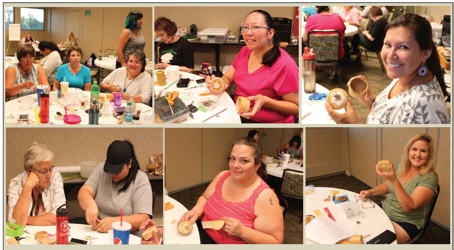
For more Art of the Quillbox Workshop photos visit www.sagchip.org/ziibiwing

Anishinabe Day of Culture was held in downtown Mt. Pleasant, Michigan on Monday, August 22. It was a beautiful afternoon made more beautiful by the sounds and sights of Anishinabe culture. This Ziibiwing event was a celebration of Anishinabe culture in collaboration with Art Reach.